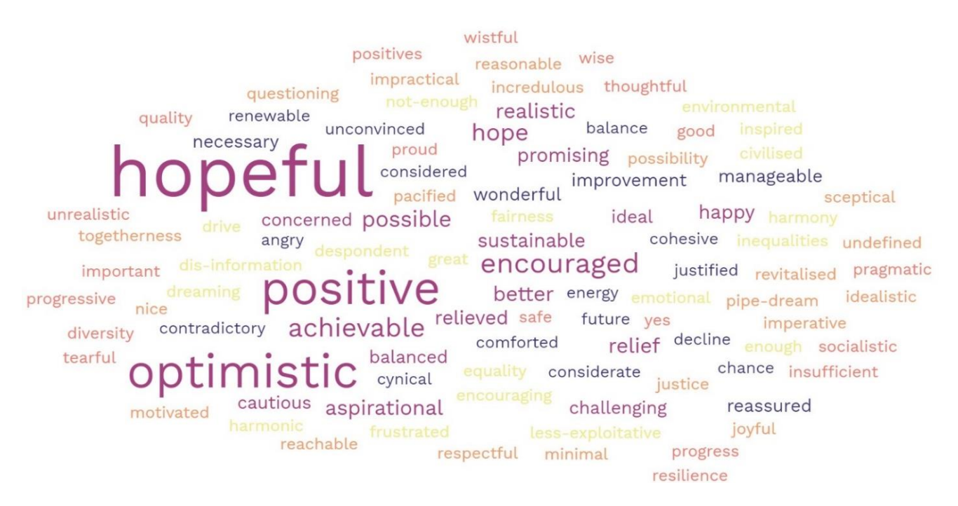
Figure 5.2: Scenario 2 responses