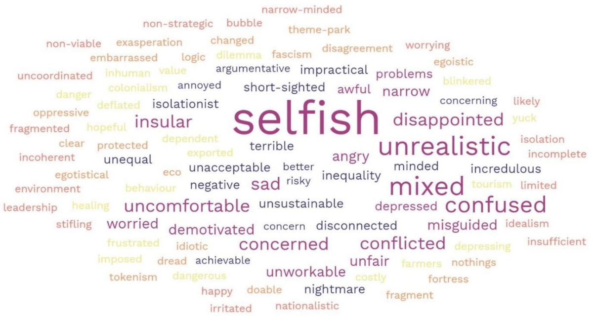
Figure 5.4: Scenario 4 responses

Source: A word cloud of Nature and Us webinar chat responses. 100 most commonly used words